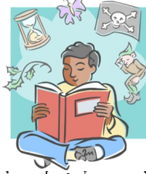
Today's reader is tomorrow's leader!